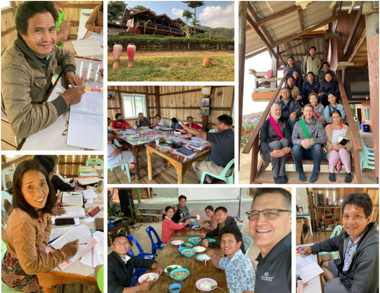
At the MPL Learning Center studying God's word together.