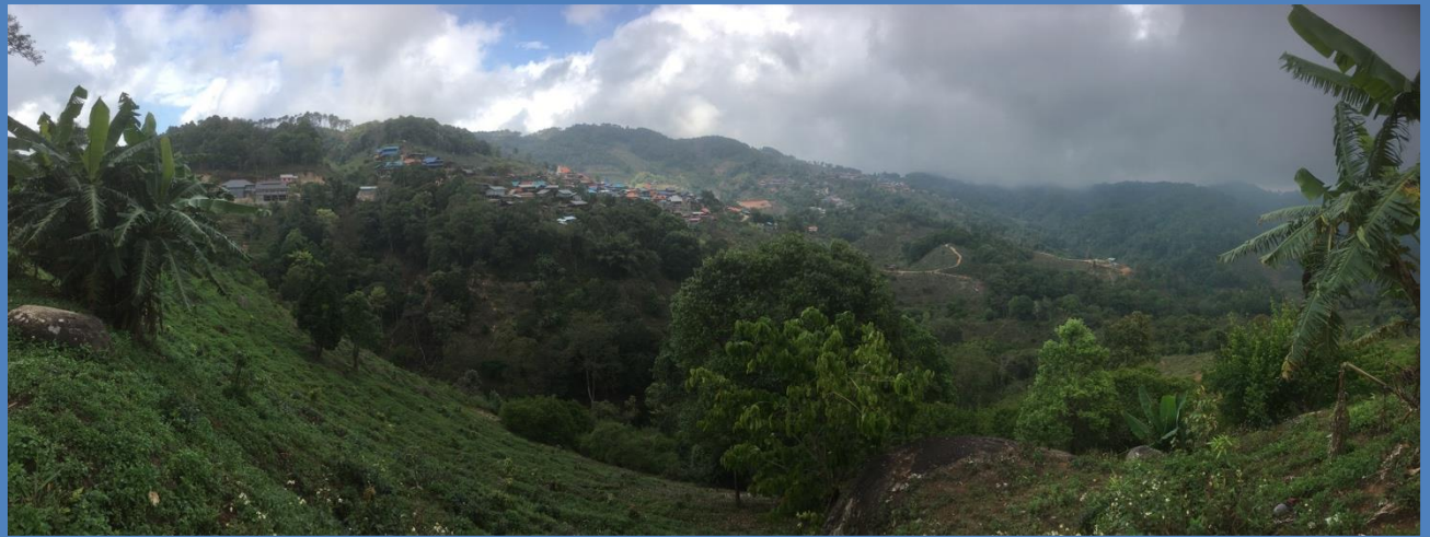
THE LAHU VILLAGE MAE PUN LUANG WHERE THE LLW LEARNING CENTER IS BEING BUILT

1 For Therefore, since we also have such a large cloud of witnesses surrounding us, let us lay aside every hindrance and the sin that so easily ensnares us. Let us run with endurance the race that lies before us, 2 keeping our eyes on Jesus, the pioneer and perfecter of our faith. For the joy that lay before him, he endured the cross, despising the shame, and sat down at the right hand of the throne of God. 3 For consider him who endured such hostility from sinners against himself, so that you won't grow weary and give up. ... 35 So don't throw away your confidence, which has a great reward. 36 For you need endurance, so that after you have done God's will, you may receive what was promised.