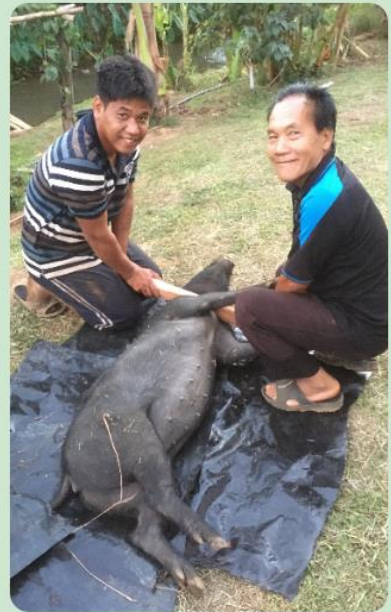
They prepared the fatted pig for the open fire roasting - much fun!