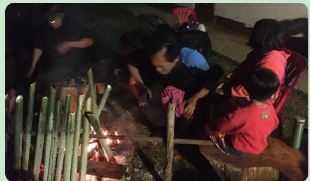
The fire masters go to work cooking everything on the open fire