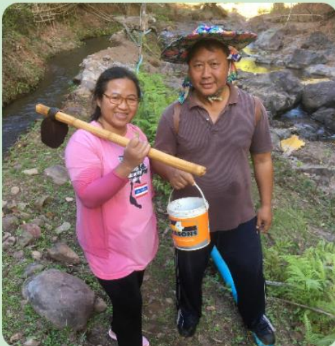
At literacy training, we all went fishing one afternoon, Lahu style with hoe and buckets!