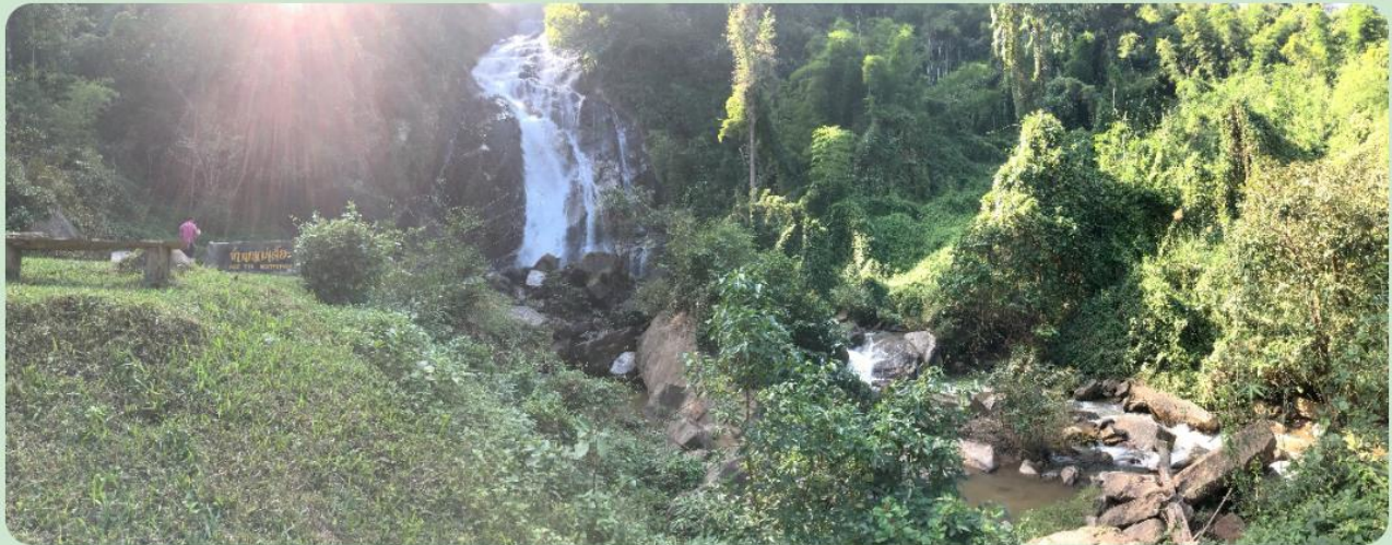
Ajarn Goi and Rob stopped by a waterfall after delivering food and cooking supplies to a nearby village. This waterfall has become Rob's favorite in all of Thailand - spectacular!!