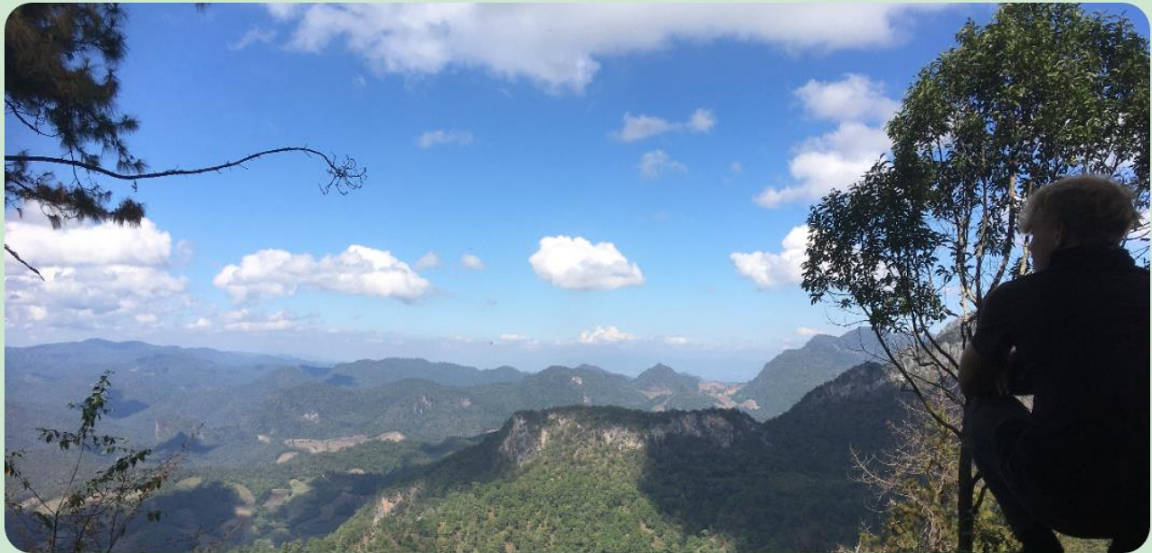
During our Christmas break, we took a motorbike ride up north to Chiang Dao mountains, one of our favorite destinations. The Lord blessed us with a perfect day for riding and hiking.