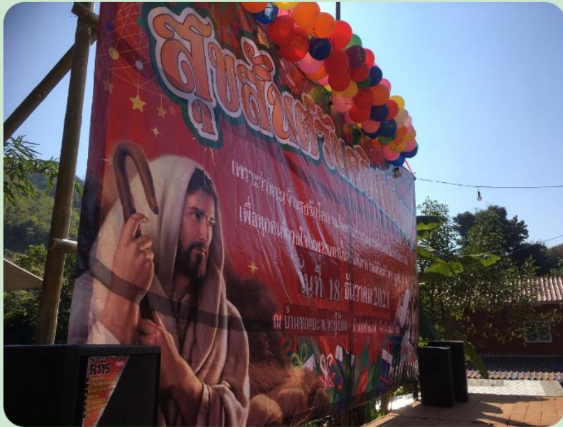
We were invited to the Christmas celebration at the village of Mai Sang Naam - a major production for this little village.