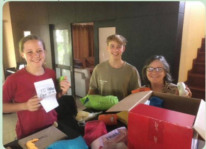
We received a bonus gift box from Kris in January and we celebrated part of Christmas again.