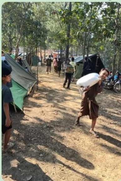
Young boys in the refugee camps delivering food to different families