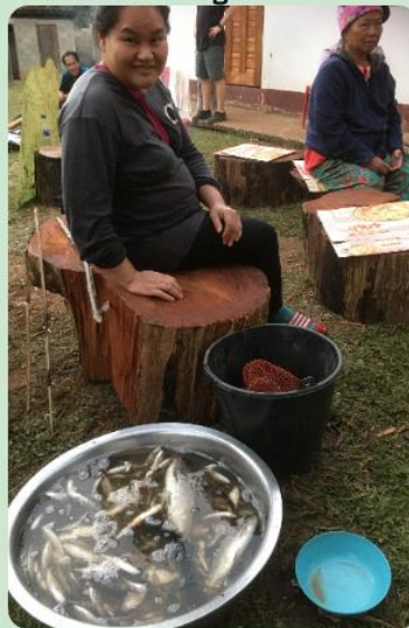
Fresh fish is prepared for the feast