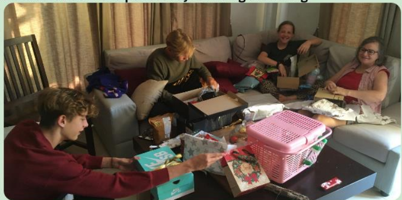
Opening gifts on Christmas morning - in the cool 60's!