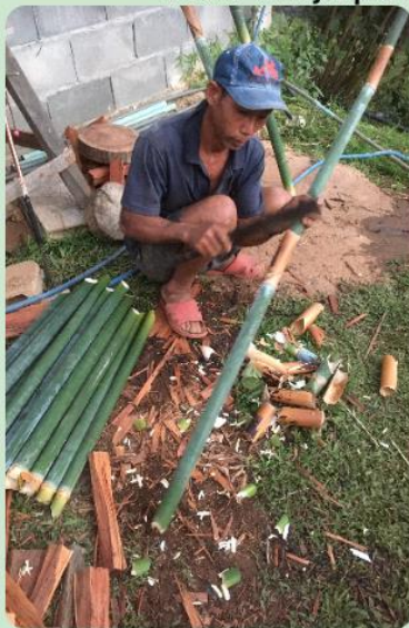
Bamboo is used for cooking and eating in 100+ different ways