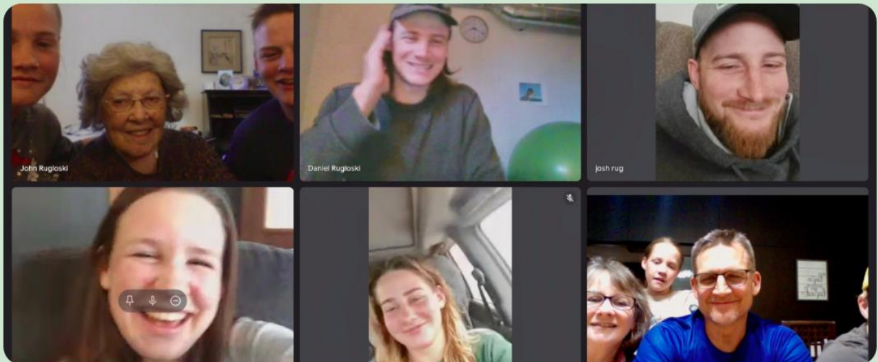
On Christmas day we were able to do a video call with the whole gang - on 2 different continents, 4 different states and 12 different time zones!! Great to see everyone and chat some.