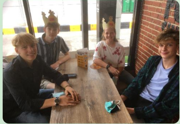
For lunch we had a special meal at Burger King - with crowns and all