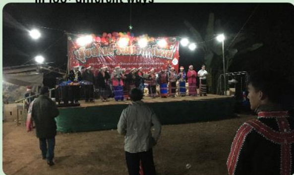
Big stage is built for the event and used for presentations, singing and skits from 7 pm - 11pm +