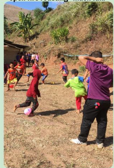
Many games are played during the day with the children - and adults!