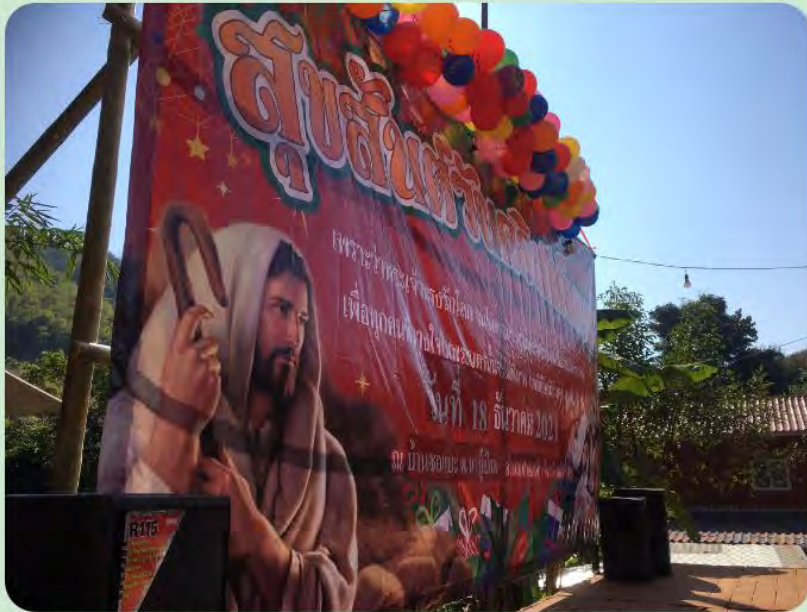
We were invited to the Christmas celebration at the village of Mai Sang Naam - a major production for this little village.