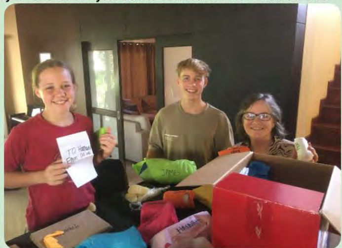
We received a bonus gift box from Kris in January and we celebrated part of Christmas again.