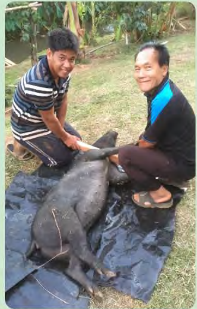
They prepared the fatted pig for the open fire roasting - much fun!