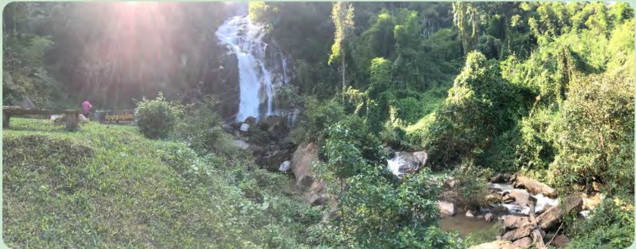
Ajarn Goi and Rob stopped by a waterfall after delivering food and cooking supplies to a nearby village. This waterfall has become Rob's favorite in all of Thailand - spectacular!!