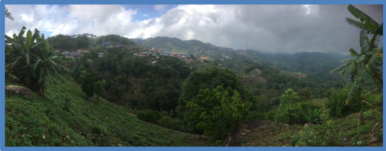
THE LAHU VILLAGE MAE PUN LUANG WHERE THE LLW LEARNING CENTER IS BEING BUILT

1 For Therefore, since we also have such a large cloud of witnesses surrounding us, let us lay aside every hindrance and the sin that so easily ensnares us. Let us run with endurance the race that lies before us, 2 keeping our eyes on Jesus, the pioneer and perfecter of our faith. For the joy that lay before him, he endured the cross, despising the shame, and sat down at the right hand of the throne of God.