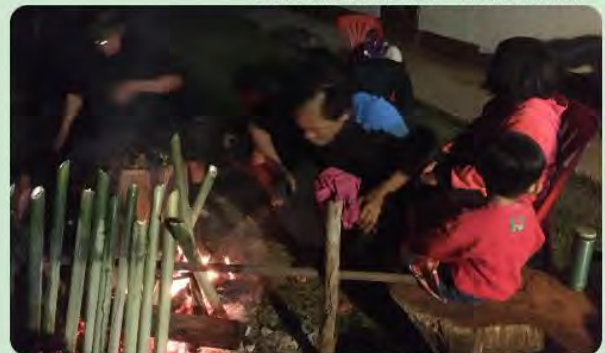
The fire masters go to work cooking everything on the open fire