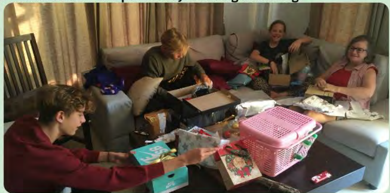
Opening gifts on Christmas morning - in the cool 60's!