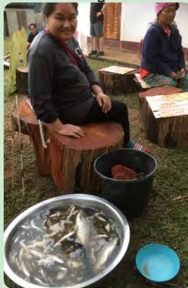
Fresh fish is prepared for the feast