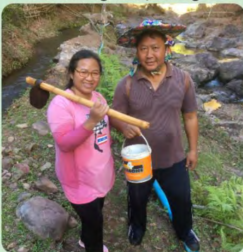
At literacy training, we all went fishing one afternoon, Lahu style with hoe and buckets!