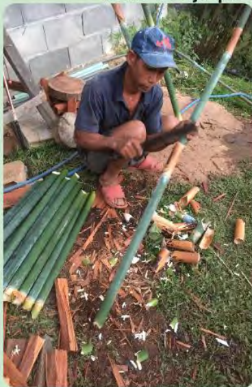
Bamboo is used for cooking and eating in 100+ different ways