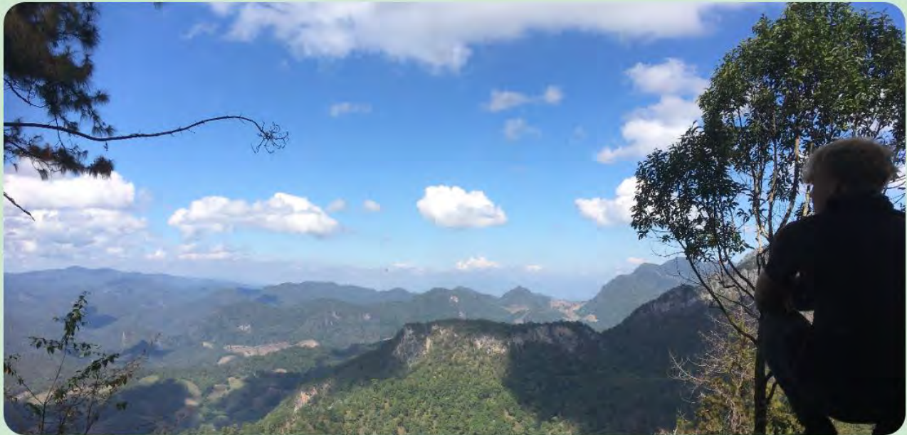
During our Christmas break, we took a motorbike ride up north to Chiang Dao mountains, one of our favorite destinations. The Lord blessed us with a perfect day for riding and hiking.