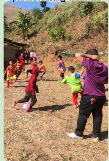
Many games are played during the day with the children - and adults!