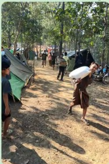
Young boys in the refugee camps delivering food to different families