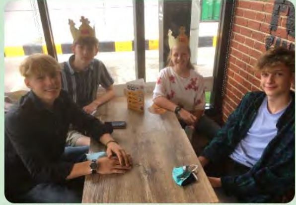
For lunch we had a special meal at Burger King - with crowns and all