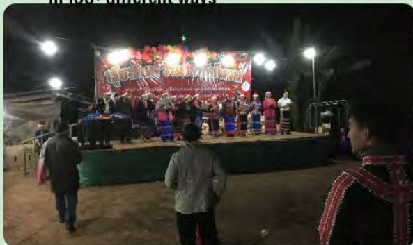
Big stage is built for the event and used for presentations, singing and skits from 7 pm - 11pm +