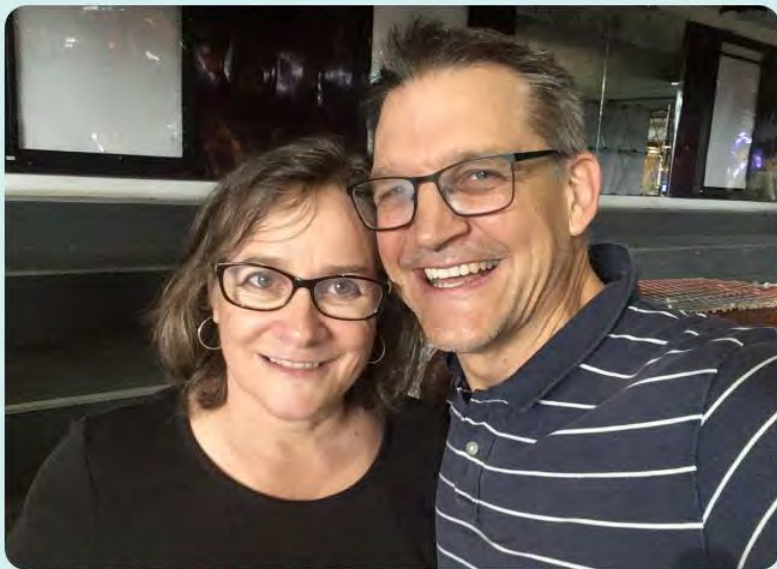
Mom and Dad join in the fun at the skating rink