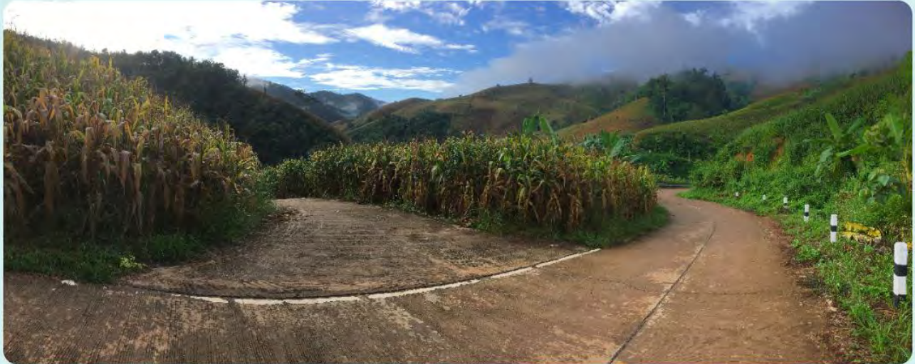
This is typical "Hill Tribe" country at sunrise - corn harvest is coming soon.