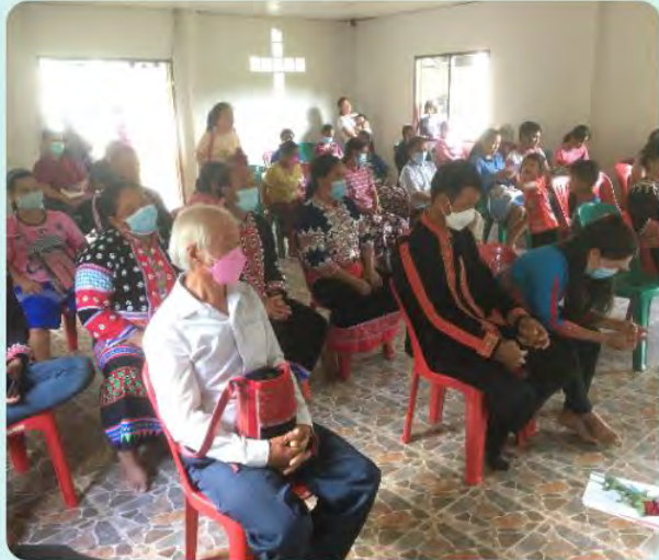
We finally made it to the Bang MaPha area to complete the Marriage Seminar.