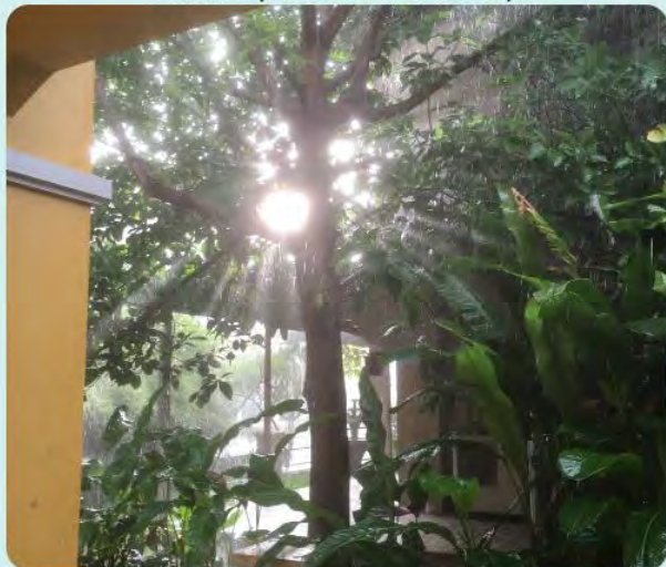
It's hard to tell in this pic, however, it is a full down pour of rain with sunshine.