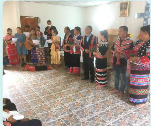
Different groups of friends sang songs to the three couples to celebrate.