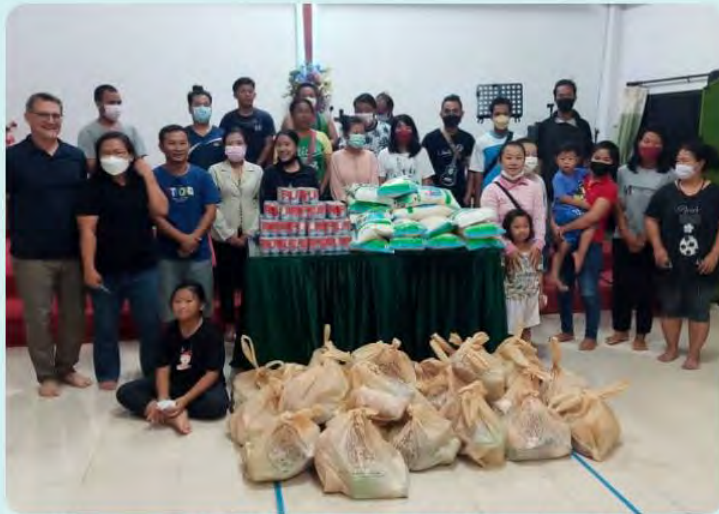
We were able to bring about 30 foodpacks for families at the Grace Lamphun church.