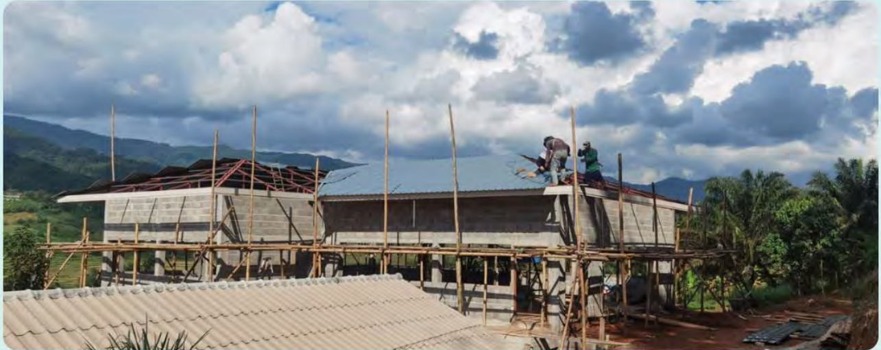
This is the new training center being built near Mae Ai, next to Myanmar. Ajaan Mawsom is a graduate of BLT wants to host the 2-week training for the church leaders nearby.