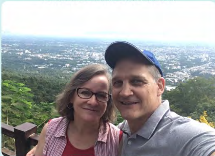
Taking a ride up the mountain with my lovely wife - perfect weather in Chiang Mai