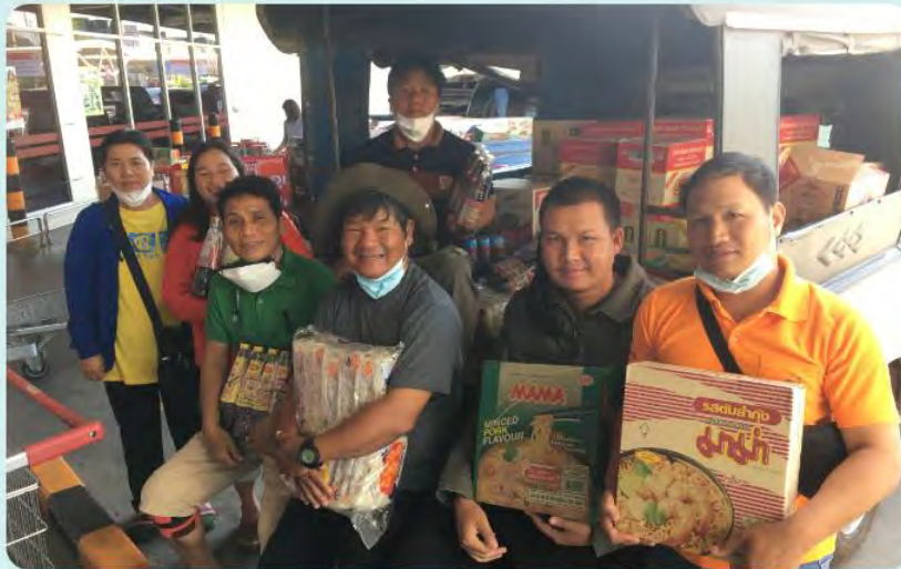
Loading up another food pantry delivery for church and orphanage in Doi Saket.