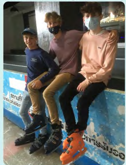
Birthday celebration at the skating rink