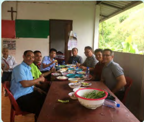
The church leaders ate together and discussed future plans for ministry.