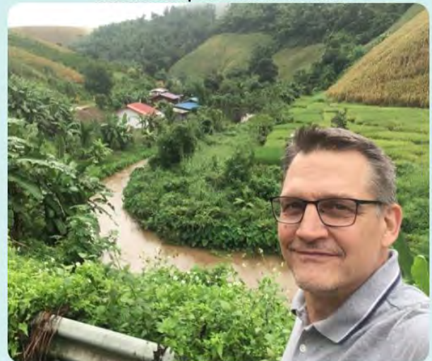
In the early morning overlooking the Saw Baa Church, I took a pic of the lush valley.