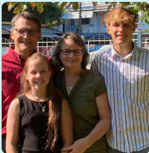
We got some extra pics after church.