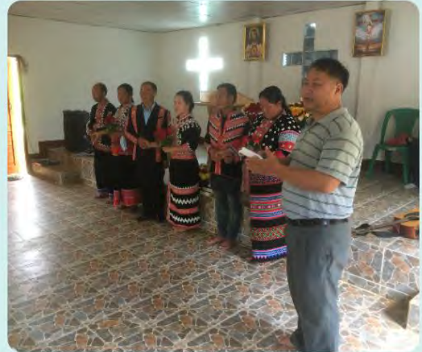
Three of the couples wanted to do a Christian wedding since they were married as Buddhists.