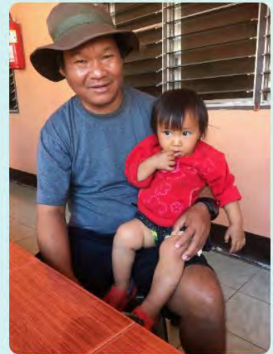
One of the babies at the orphanage with a home parent.