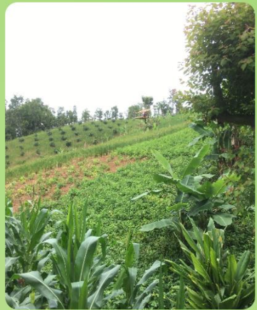
Some nearby fields that provide food for the orphanage