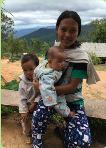
Many families were grateful for the food