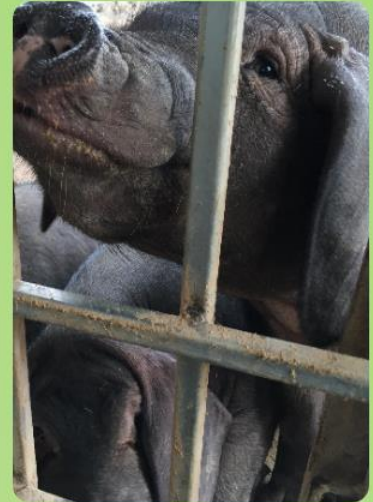
Pig for pork sniffing the visitors