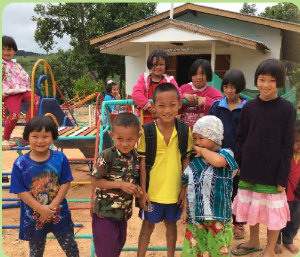
Always a delight to see the children and visit with them