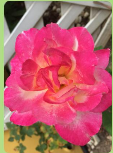
Carol's roses in full bloom - incredible!