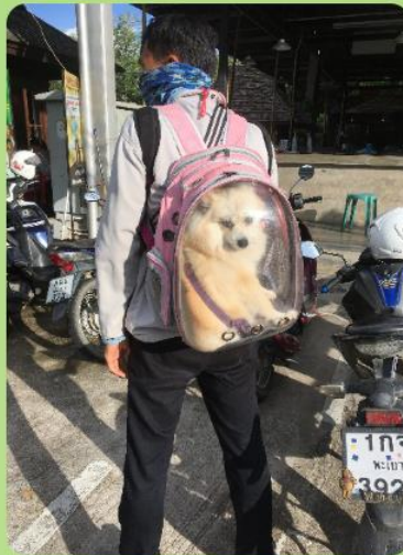
Random pic - how to travel on a scooter with your dog!!