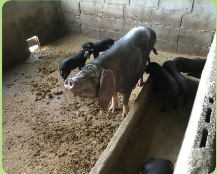
Piglets growing up, about 3 months old and they all eat like pigs!