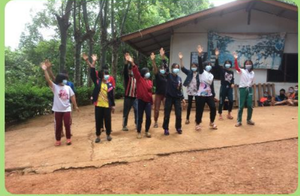
Often the children will prepare a song to sing to us along with a dance routine, each age group giving us a performance