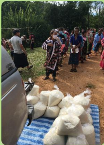
The families que up waiting for the food packs to bring home